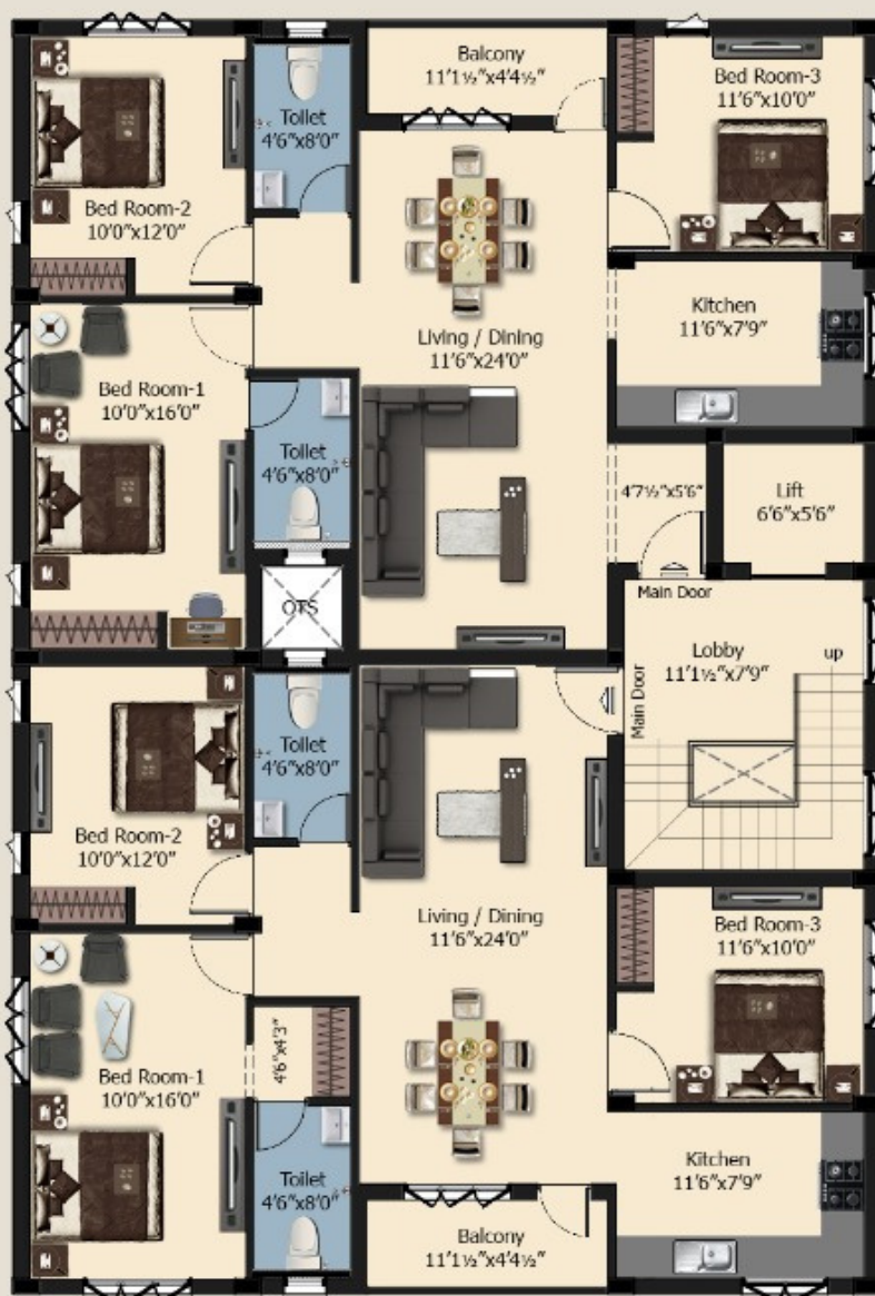
TYPICAL FLOOR PLAN 1ST, 2ND & 3RD

LIORA BUILDING PROJECTS LLP AN EPITOME OF CLASS